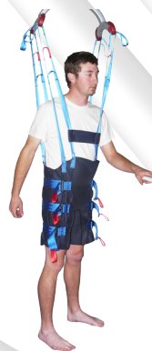
Ambulation Shorts AS-APEX XS,S,M,L,XL,2XL,3XL BARI80, BARI120