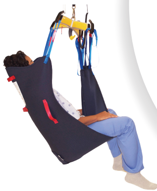
Advantage Seated SHB-ADV-(S,M,L,XL)