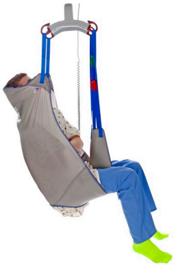
Single Patient Seated SHB-1PS-(S,M,L,XL)