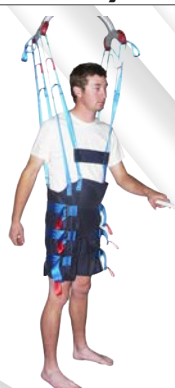
Ambulation Shorts AS-APEX XS,S,M,L,XL,2XL,3XL BARI80, BARI120