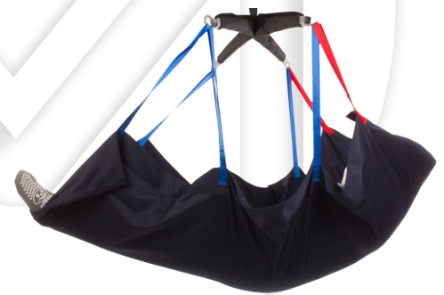
APEX Repositioning REP-APEX-STD