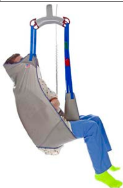
Single Patient Seated SHB-1PS-(S,M,L,XL)