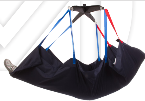
APEX Repositioning REP-APEX-STD