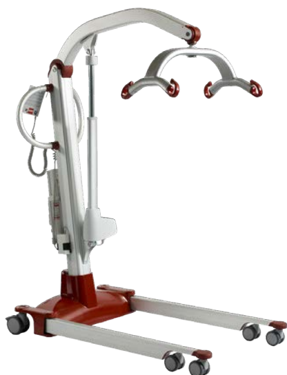
Shown without Ambulation Arms