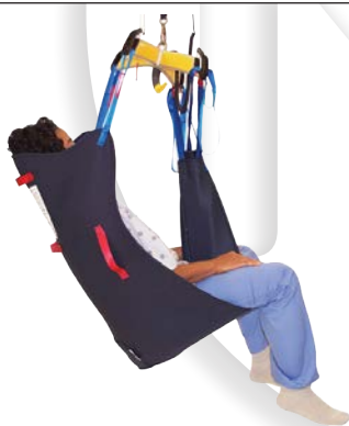
Advantage Seated SHB-ADV-(S,M,L,XL)