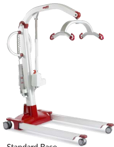
Standard Base Four Point Carry Bar Option