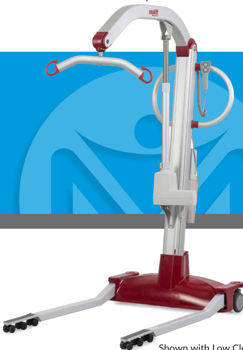
Shown with Low Clearance Two Point Carry Bar Option

A Versatile Everyday Lift With A Low Clearance Option