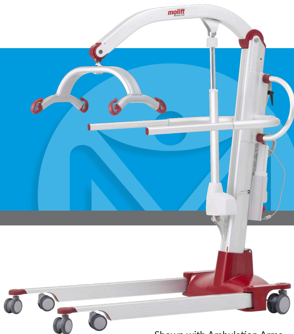
Shown with Ambulation Arms

The Choice For A Versatile High Capacity Lift