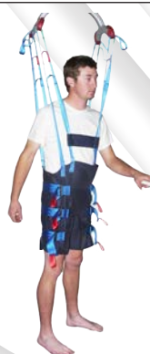
Ambulation Shorts AS-APEX XS,S,M,L,XL,2XL,3XL BARI80, BARI120