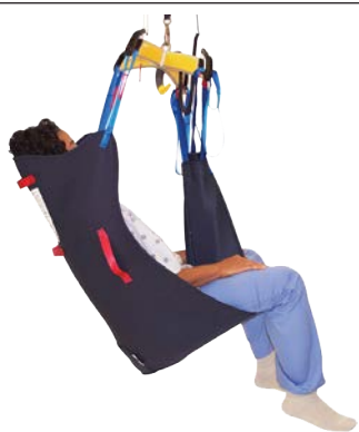
Advantage Seated SHB-ADV-(S,M,L,XL)