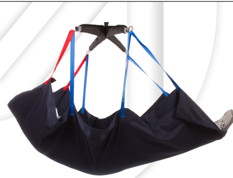
APEX Repositioning REP-APEX-STD