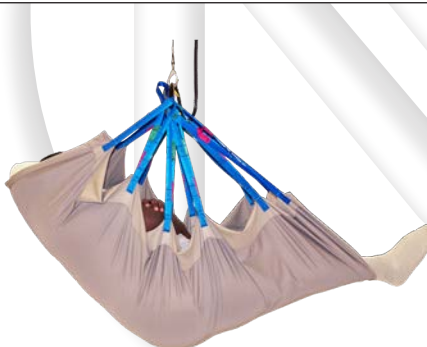
Single Patient Repositioning REP-1PS-STD