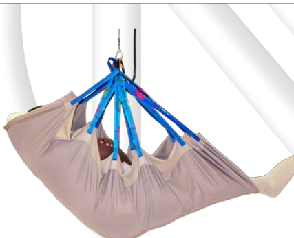
Single Patient Repositioning REP-1PS-STD